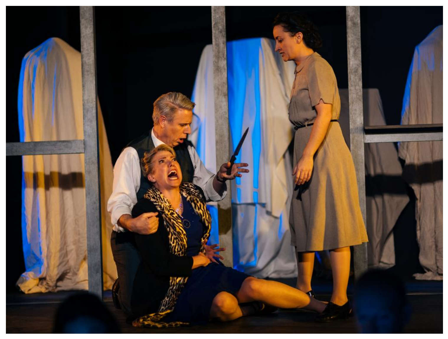
Love Burns by State Opera South Australia.

Almost 30 years from the 1992 Adelaide Festival premiere, Graeme Koehne's sparsely textured score for chamber ensemble stands up well, and Anthony Hunt is alert to the shifts of rhythm and emotional temperature.