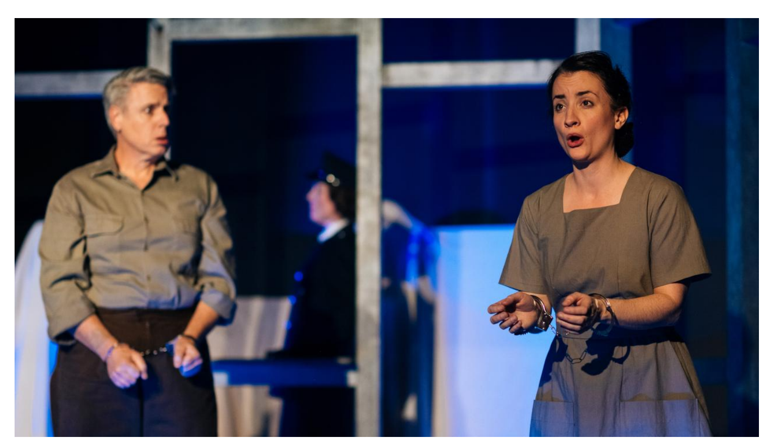
Love Burns by State Opera South Australia.